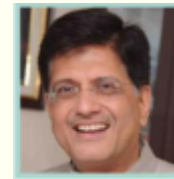
Shri Piyush Goyal Hon'ble Minister of Railways & Coal, Govt. of India

‘CONVENIENT ACTION – continuity for Change’ by Narendra Modi.