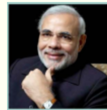
Shri Narendra Modi Hon'ble Prime Minister of India

“Due to the use of washed coal, the energy consumed in transportation, handling and milling, is optimized as the inert material from coal is eliminated. This helps in reducing the auxiliary consumption of equipment involved in coal processing because the use of improved quality coal ultimately results in reduction of emission of GHG as compared to conventional coal.”